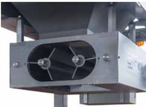
The three-sided Teflon coated blades are easy to clean.